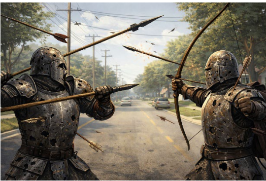
Images created by AI